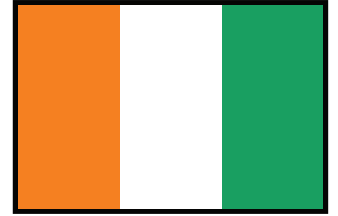
Flag Proportion 2:3